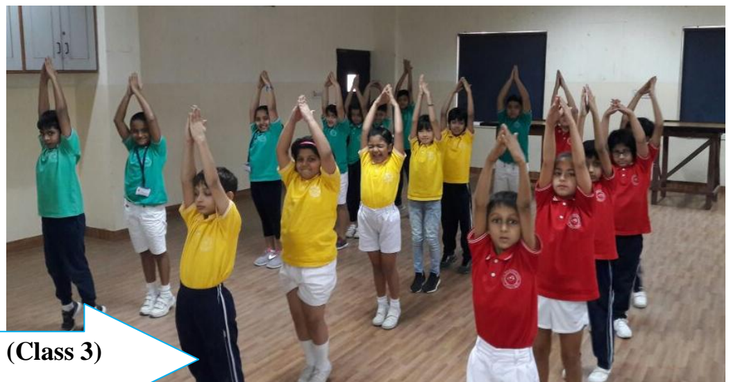
The Mountain Pose (Class 3)