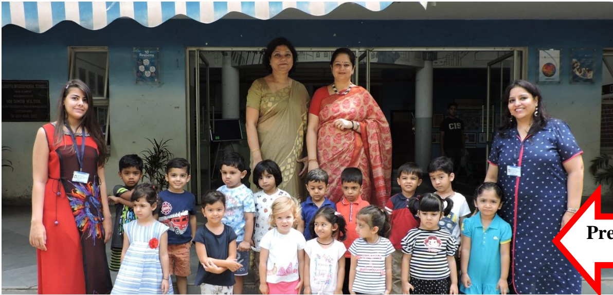
Pre Nursery A

This year we have a vibrant and active batch of 35 children in sections A and B together. They are gradually settling down in their new environment and we look forward to a good year together.