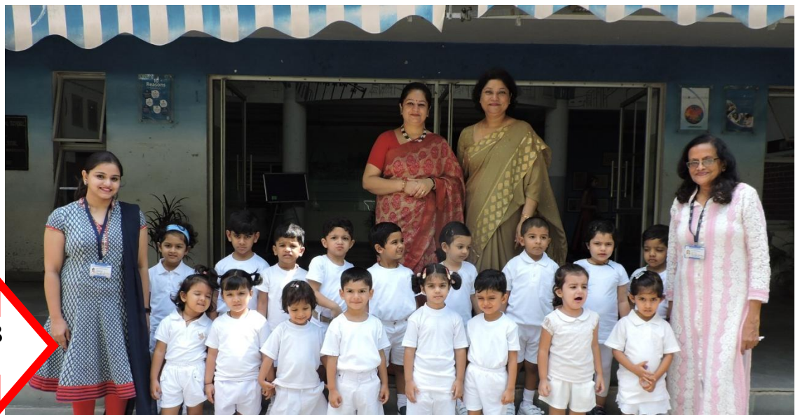
Pre Nursery B