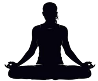
The Lotus Pose (Class 5)